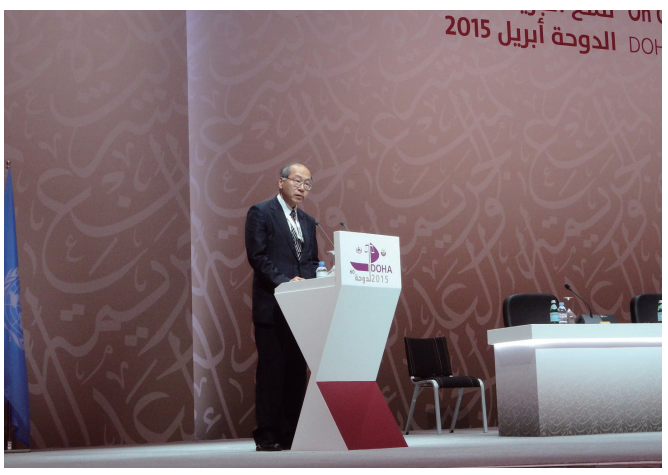
Then-Procecutor-General Ohno announcing that Japan will host the 14th Congress in 2020

UNAFEI will play an active role in organizing a workshop on reducing reoffending at the forthcoming 14th Congress in 2020, which will be held in Kyoto, Japan.