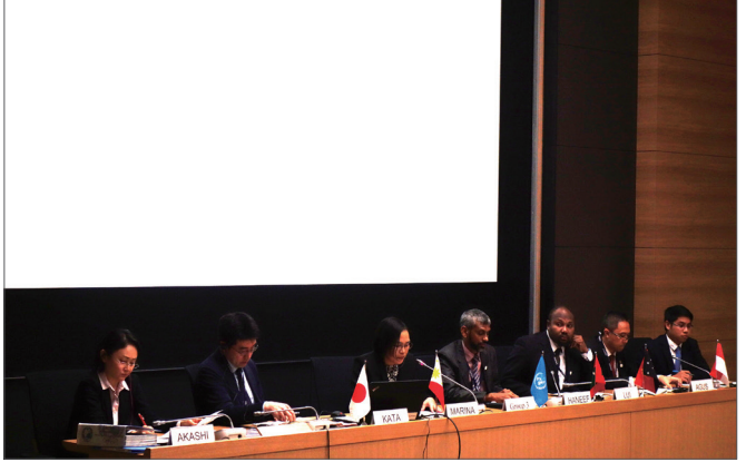
Presentation by participants at a Plenary Meeting