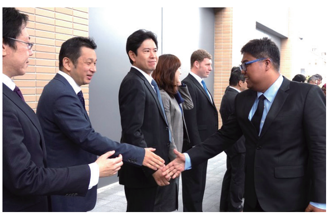
Participants of an international training course arrive at UNAFEI