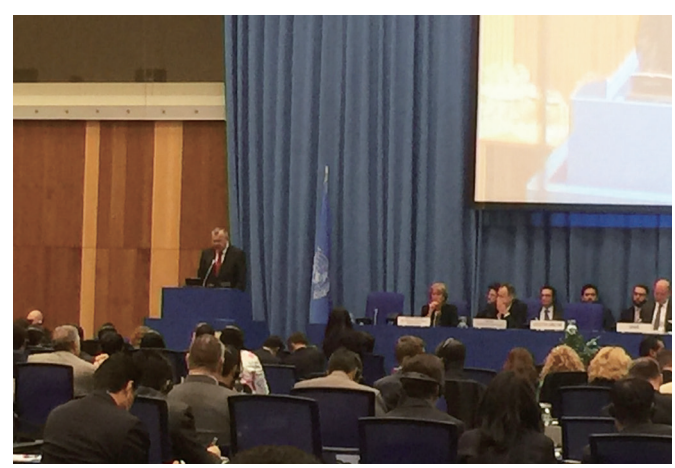
The UN Commission at Vienna, Austria