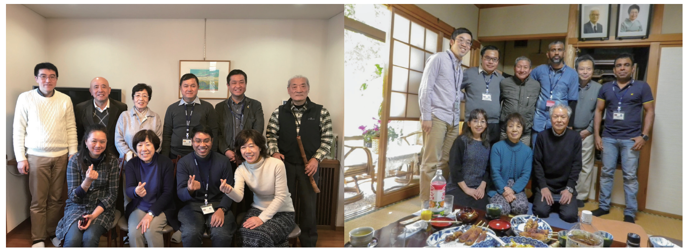
Participants visit homes of Volunteer Probation Officers