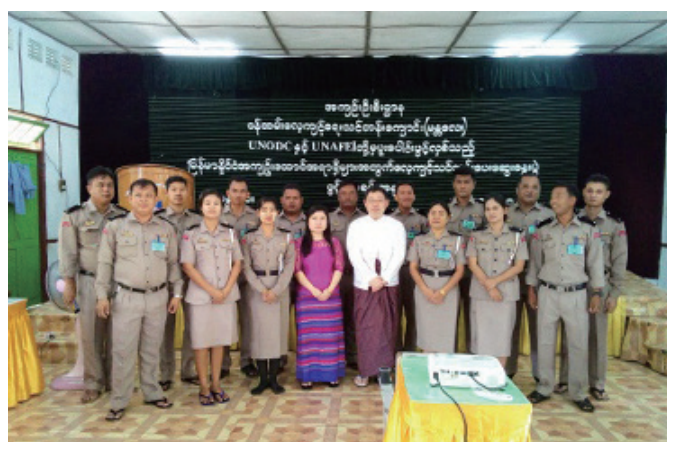
Training Seminar for Prison Officials in Myanmar