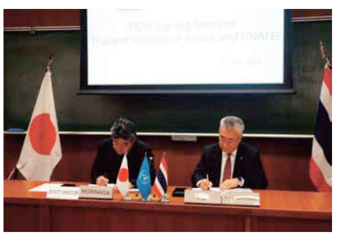
Signing an MOU between UNAFEI and the TIJ