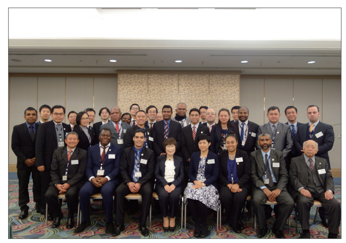
International Friendship Party hosted by the ACPF Hiroshima Branch

ACPF has been granted General Consultative Status, the top category of UN NGOs (international nongovernmental organizations that are granted UN consultative status). ACPF has many branches overseas and in Japan.