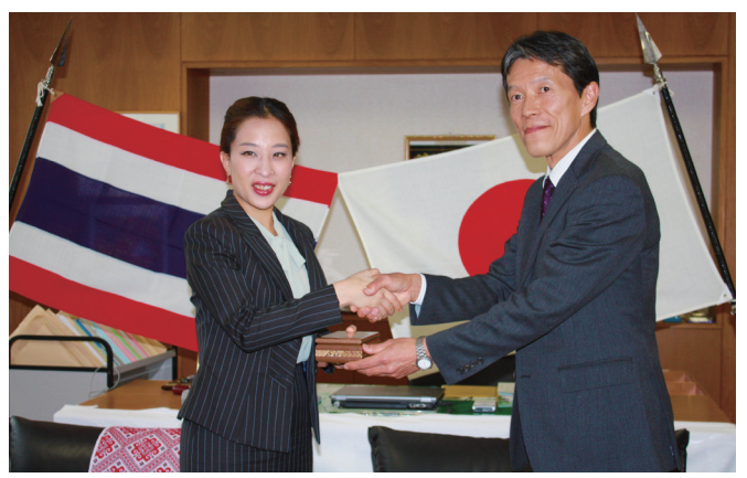
Her Royal Highness Princess Bajrakitiyabha of Thailand visits UNAFEI