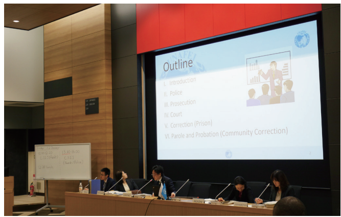
Lecture by a UNAFEI professor