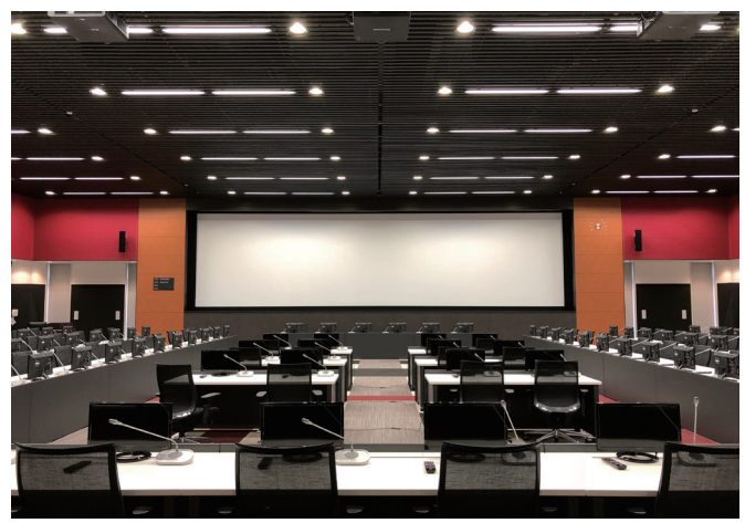
International Conference Hall A

The participants and overseas visiting experts stay in the dormitory attached to UNAFEI's main building. The living environment and meals are designed to meet the individual needs of the participants, etc., so that their stay will be as comfortable as possible. In their free time, they can enjoy activities such as table tennis, working out in the training room, etc.