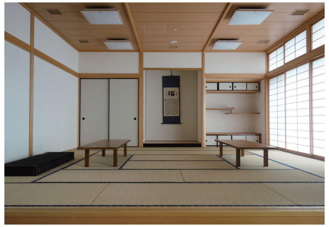
Japanese tatami room