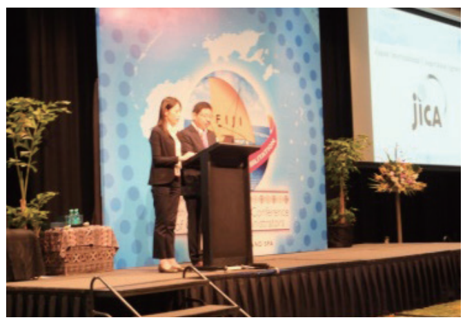
The Asian and Pacific Conference of Correctional Administrators (APCCA) (Fiji)

UNAFEI is actively involved in various activities for the betterment of criminal justice around the world. UNAFEI dispatches its faculty and staff members overseas to participate in international conferences, such as the Asia and Pacific Conference of Correctional Administrators, the ICPA Annual Conference, and the General Meeting of the International Association of Prosecutors, among many others.