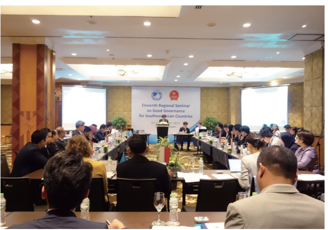
The 11th GG Seminar (Viet Nam)