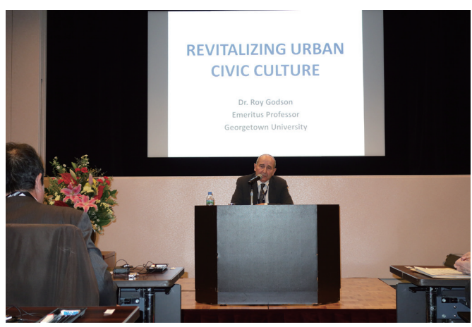
Public lectures on criminal justice policy

Annually, UNAFEI, the Japan Criminal Policy Society and the ACPF jointly hold a public lecture on criminal policy where eminent overseas experts in the field of criminal justice are invited to lecture on ground-breaking topics involving criminal policy, crime prevention and criminal justice.