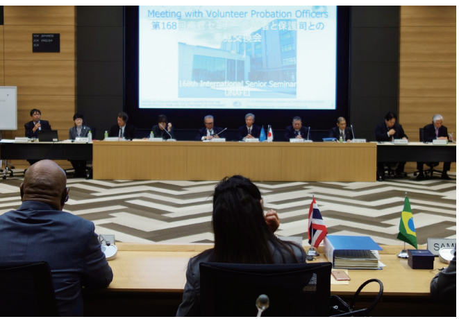
VPO International Seminar

The VPO seminar provides the VPOs with an opportunity to exchange their views with the participants of the international training programmes in order for the VPOs to learn about current international trends in criminal justice and the current situations in the countries participating in UNAFEI's courses and seminars.