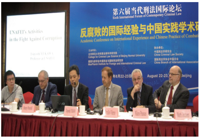
International Forum of Contemporary Criminal Law (China)