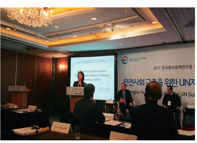
The PNI meeting (Korea)