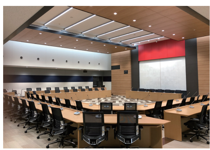
International Conference Hall B