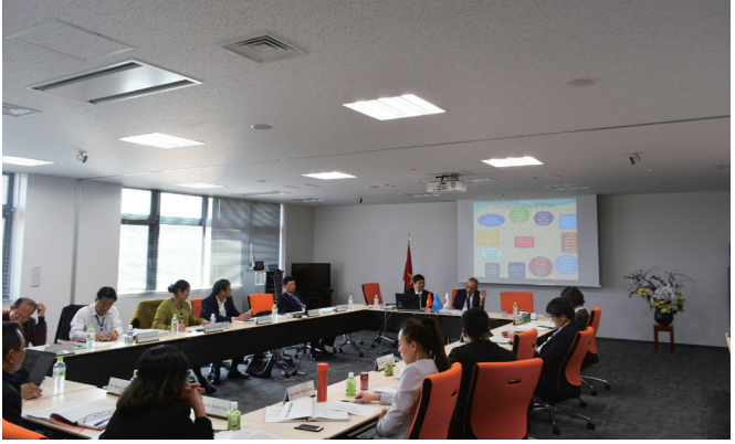
Training Course on Legal Technical Assistance for Viet Nam