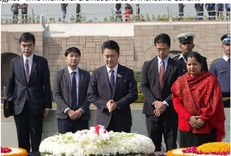
Minister Yamashita (center), laying floral tribute at the Rajghat

O India Rajghat (The Memorial Cremation Site of Mahatma Gandhi)