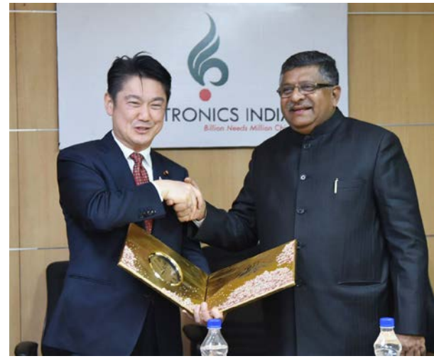
O India The Hon. Minister of Law and Justice, Mr. Ravi Shankar Prasad