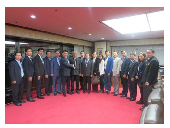
The trainees and Minister Yamashita

Minister Yamashita welcomed the trainees including Mr. Tith Rithy, Prosecutor of the Ministry of Justice, Kingdom of Cambodia. Minister Yamashita stated that Government of Japan places emphasis on projects of legal technical assistance for Cambodia, and he looks forward to further enhancing cooperation between the two countries in legal affairs.